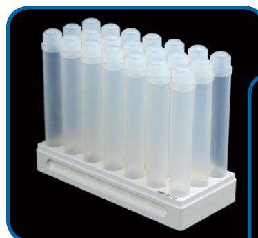
MRH-21 autosampler micro rack with 12 mL PFA-T16 tubes and PFA-C16 caps