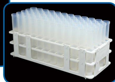
LR-60-16 autosampler large rack with 12 mL PFA-T16 tubes