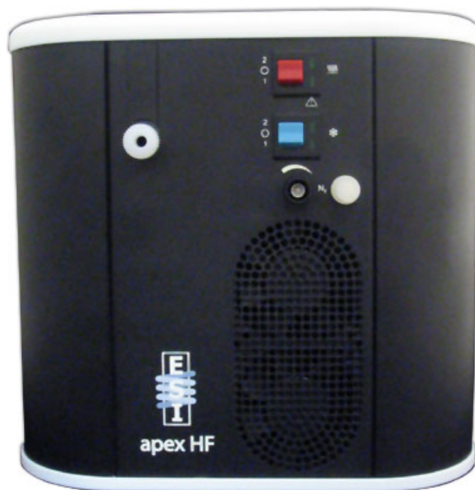
Apex HF high efficiency inlet system