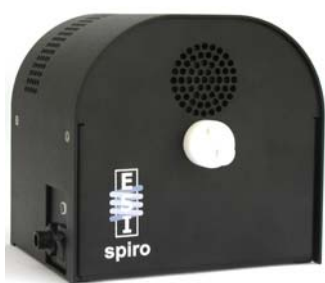
Spiro TMD Module

ACM Cooled Micro-Porous Nafion ® membrane.