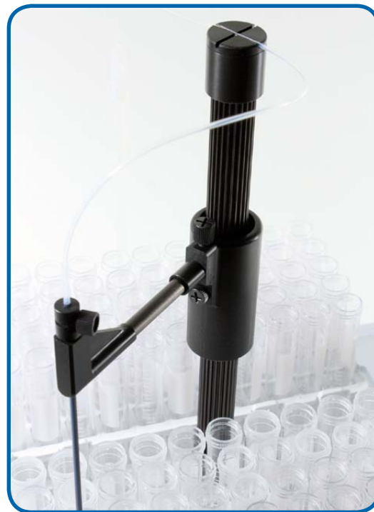
C6 Carriage with 360 Cap

The C6 carriage is now standard on the following autosamplers: